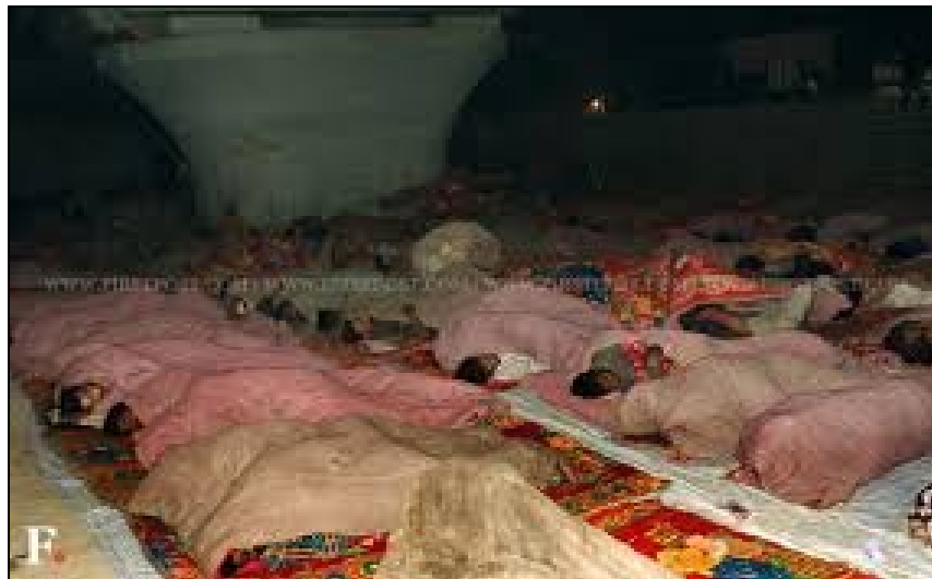
Temporary Night Shelter at Shukurpur

We are running one permanent night shelter in Mukherjee Market near Jhandewalan and two night temporary shelters in Cement siding, Shukurpur for homeless people. In that shelter homeless people are getting blanket in winter season to sleep and getting the facility of toilets.